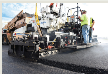
The key to success on this project was to keep the paver moving for the entire length of each mat placed.