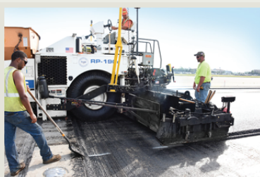
Union Concrete and Construction Corp. crews use a Roadtec RP-190e paver with a Carlsson EZR2 Rear Mount Screed to successfully execute a 26-foot-wide asphalt mat.