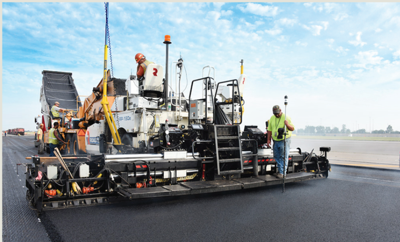
A ready supply of trucks in the distance was crucial to maintaining a continuous, non-stop paving process. Some passes were as long as 3,000 feet.

The Carlson EZR2 rear mount screed was used for weight and its four-inch chrome rods tightly fixed to a heavy-duty tubular frame, providing the extensions with optimal rigidity and eliminating independent movement of the chrome rods. Large adjustable slide blocks and bushings eliminate flexing at wider widths, especially important for laying the surface course up to 26-foot wide. A two and three-foot screed section was bolted and leveled on each side, with three 2-foot strike offs affixed, also added on each side. Six-foot auger extensions were attached to make sure the asphalt material went to the end of the screed. The pre-strike offs made sure a nice head of material was kept all the way across. Screed vibration for additional compaction throughout was maintained during all paving.