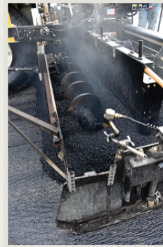
The Roadtec paver came equipped with a MOBA-matic II grade and slope automation (photo at left). Asphalt transfer machines were used to keep the wide screed supplied with ample material.

"Mostly the sections had good phase lines where it made sense to phase to and then switch to another phase since the paving was done in sections. Sixteen hundred feet had to be completely rehabilitated to subbase on one end of the runway before intersecting with Runway 5/23. It would be four feet deep, which included rubblization of 27,000 square yards, full depth construction and repairs and full depth HMA pavement construction at the long runway stretch. Full depth blacktop included eight inches of base course done in two lifts using 16,200 tons of P-401 HMA and four compacted inches of surface course done in two lifts of two inches each," Stayer continues.